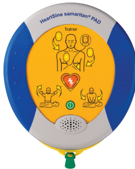
HeartSine samaritan PAD 350P Trainer (TRN-350-XX*)

*XX represents two-character language code.