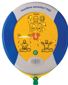
HeartSine samaritan PAD 450P Trainer with CPR Rate Advisor simulation (TRN-450-XX*)

HeartSine samaritan PAD Trainers have no capability to diagnose or treat an arrhythmia. They are intended to simulate the use of an AED for instructional purposes only.