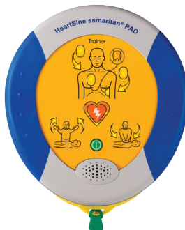
HeartSine samaritan PAD 350P Trainer (TRN-350-XX*)

*XX represents two-character language code.