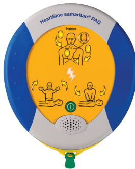
HeartSine samaritan PAD 360P Trainer (TRN-360-XX*)