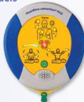
samaritan PAD 500P Trainer with CPR Rate Advisor Simulation (TRN-500-xx)