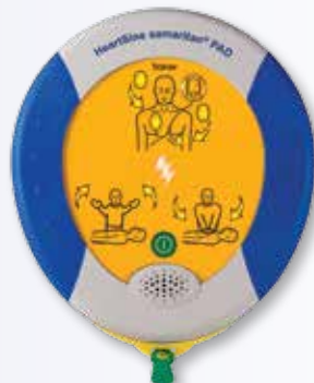
samaritan PAD 360P Trainer (TRN-360-xx)