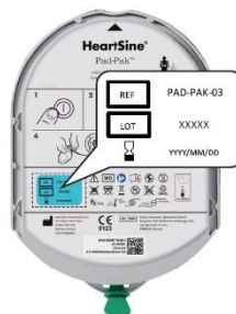
Figure 2 – Pad-Pak Expiry