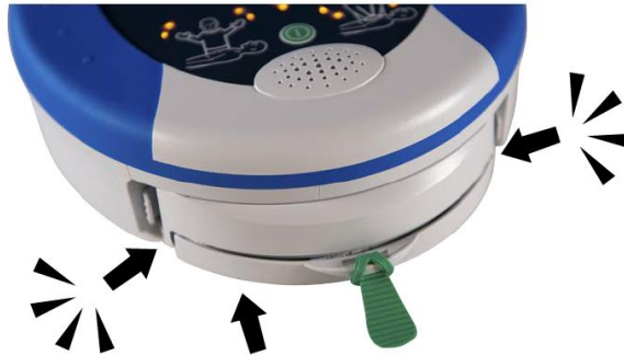
Figure 3 – Inserting a Pad-Pak